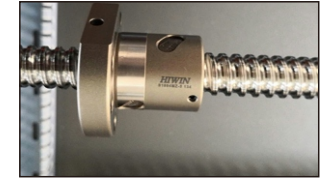
Ball Screw Movement