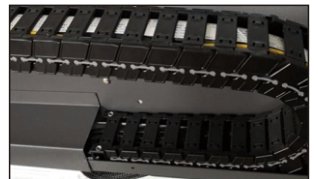
Strong Tank Chain