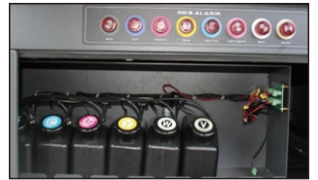
Ink Lacking Alarming System