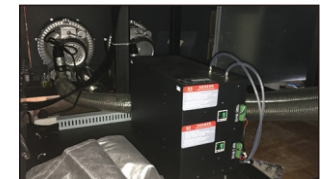
Negative Pressure System